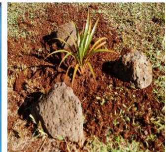
These two new haloalo were planted in the north.